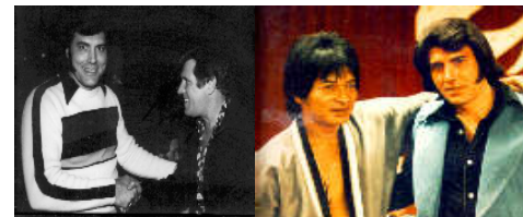
Don Ho Glen Campbell